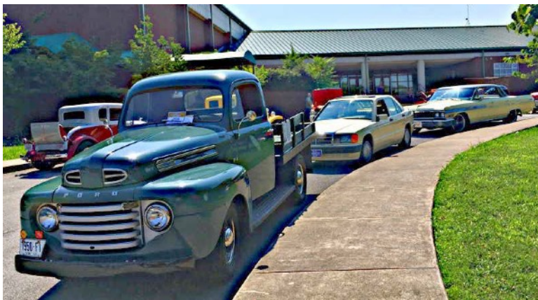
Jim B, Don and Ed showed 3 of the 150+ cars at the Larmar Show

I changed my car horn to gunshot sounds. People get out of the way much faster now.