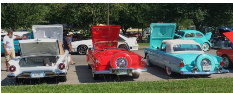
Nice comparison of the 1955, 56 & 57 Ford T-Birds at the Lamar Show