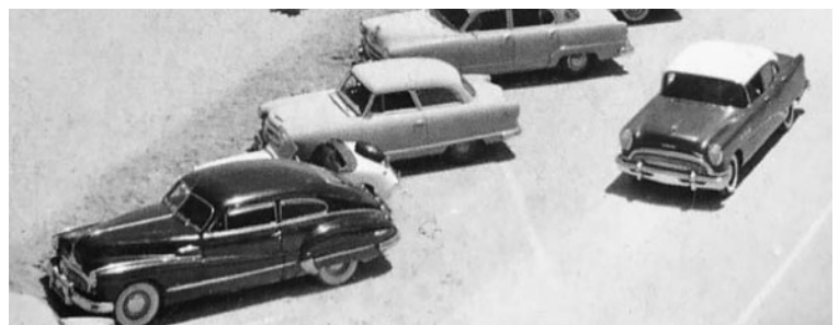
Can you find the 1950 Crosley Super Hot Shot in this 50s parking lot. I missed the first time I saw it.