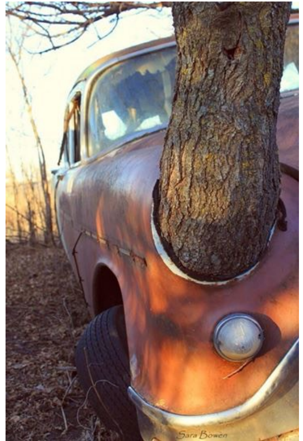
1954 Oldsmobile Caught Trunk Driving