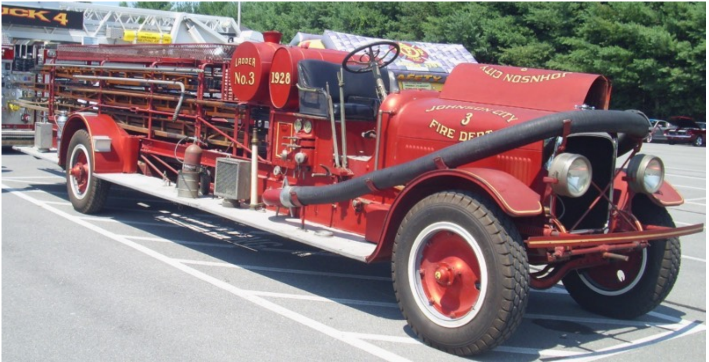
1928 Seagrave fire truck being restored by members of the Johnson City fire department