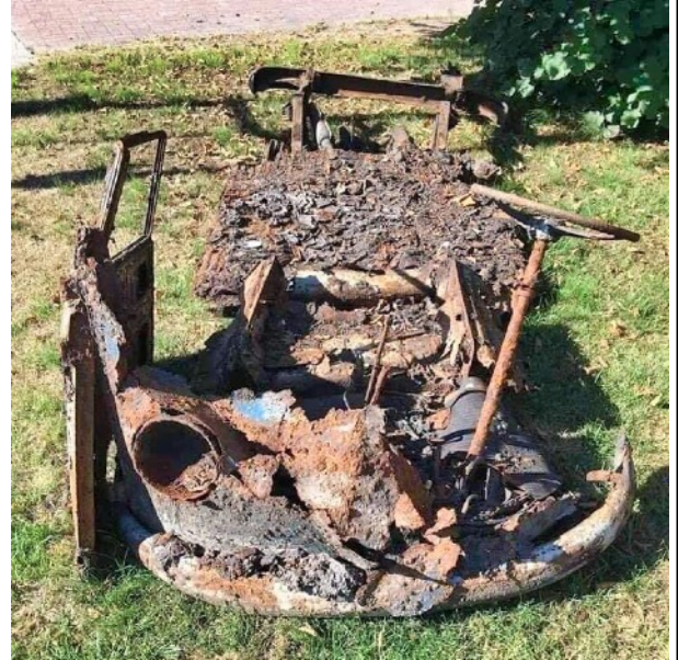
Actually a VW Bus