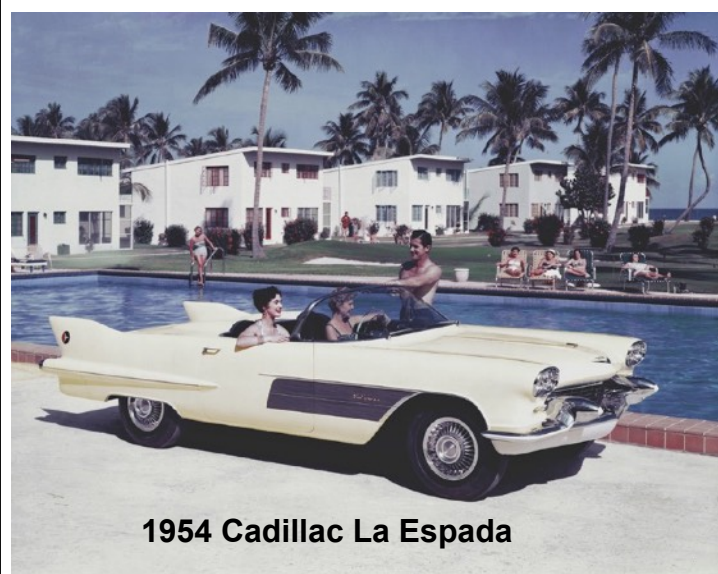
1954 Cadillac La Espada

both with wide open mouth grilles, one called the F-88, sharing the chassis with the Corvette but a V-8 motor, while the other was the Cutlass, a sexy two seater fastback. Buick was fairly conservative that year. They showed us a normal production sedan with a little custom roof and trunk treatment and called it the Landau, while their Wildcat II was another two seat far out sports job with floating headlights and open front wheel-wells. However, to me the coolest looking pair was the Cadillacs. The La Espada was the roadster, I think it was metallic pearl white with a mist of