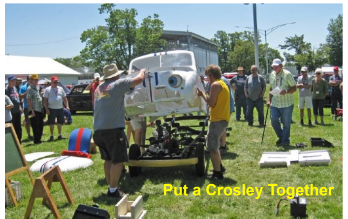
Put a Crosley Together

Friday is Game Day as well as the official opening of the flea market, 39 vendors this year. We had a special exercise to create a photo op for the 50th Anniversary of the club and 80th Anniversary of the first production Crosley. Two favorite games this year was a Crosley put together race and going to the dance. A Crosley was assembled from parts and driven off the field, with the winning team at 11 minutes. Going to the dance is a speed and style competition with a team stopping at several locations and putting on a piece of clothing and doing a dance