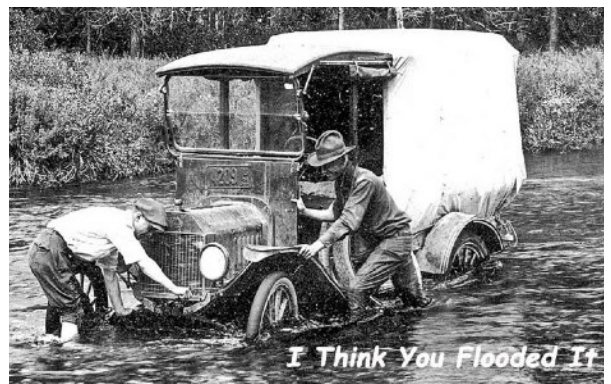
I Think You Flooded It