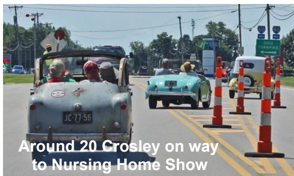
Around 20 Crosley on way to Nursing Home Show

For those that don't know us well yet, we disappear to NW Ohio the first part of July every year and have been for 47 years. That is when/where the National Crosley Meet happens. This was the 50th anniversary of the club and the 80th anniversary of the first production Crosley so it was a big year for the gathering.