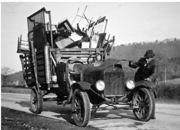
Mary & Bob moved back to Asheville. Good luck in your new adventure.