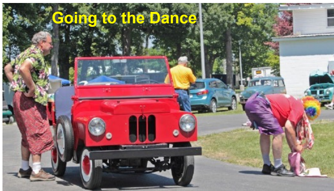
Going to the Dance

Saturday is Show Time - We lined up for photos before going on the field, record 133 Crosleys on the field and another 35 or so on the grounds that couldn't be bothered to be on the show field or for