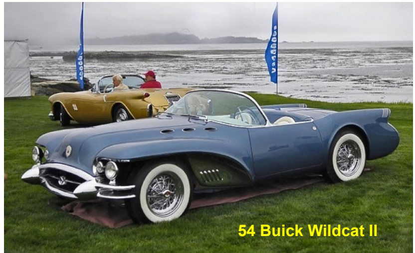
54 Buick Wildcat II

gold to it and its coupe partner was in a silver metallic or metal-flake named the El Camino. (This name later on was given to a Chevrolet vehicle as you may know.) And back then all Cadillacs had fins. Like a rocket car. And of course there was a rocket car for GM called the Firebird which showed us all how far ahead they were. This was the first of three or four Firebird gas turbine experimental cars they came out with later on, so now today they call this one Firebird I. It was all white and looked just like a rocket on wheels. It was flashier than Flash Gordon's spaceship too. This car really looked like 300 miles per hour just standing still. For those of you who are NASCAR fans, this car is