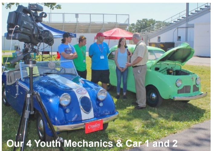
Our 4 Youth Mechanics & Car 1 and 2

sale. Our 4th Youth Project Mechanics was selected. That makes 2 finished projects that the Youth Mechanics have received their titles and two being worked on, they were interviewed for a local TV station. Mid afternoon was the annual meeting and awards presentation. The week was finished up with our annual Memorial Picnic, to remember past members.