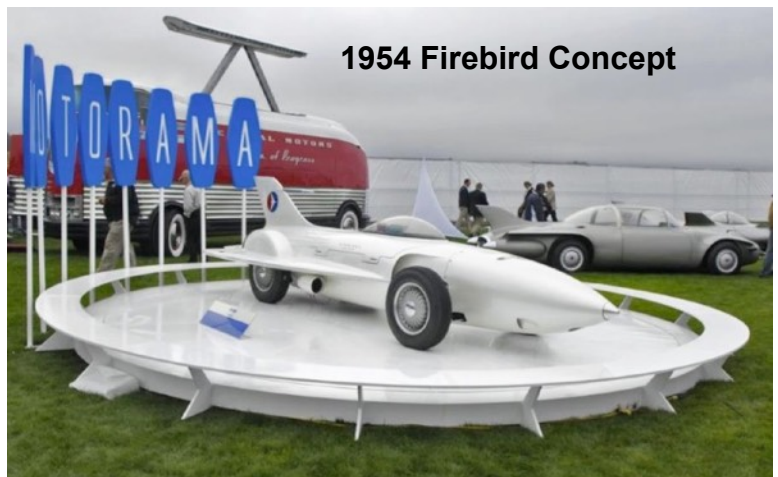
1954 Firebird Concept

GM Dream Cars represented on top of the Daytona 500 trophy awarded each year. Certainly you no doubt recognize all of the names I mentioned. Names of cars you see on the street today and in driveways everywhere. But the names of the Motorama dream cars were popular enough to be given to production cars we bought in showrooms to bring us in. And it must have worked to some extent. General Motors stopped all of their Motoramas by 1961 and it was probably because it worked too good that they sold too many cars. Or maybe key people were getting too tired of the road going circus of it all.