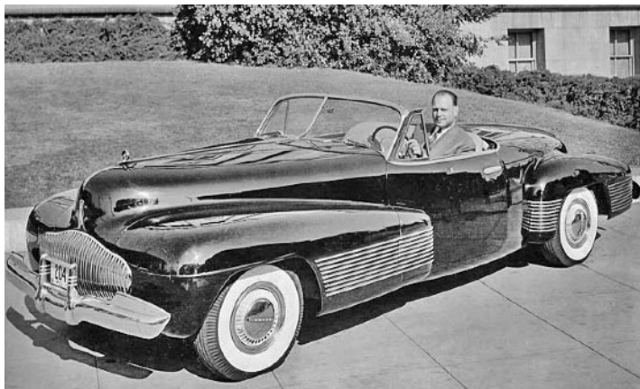
1938 Buick Y-Job