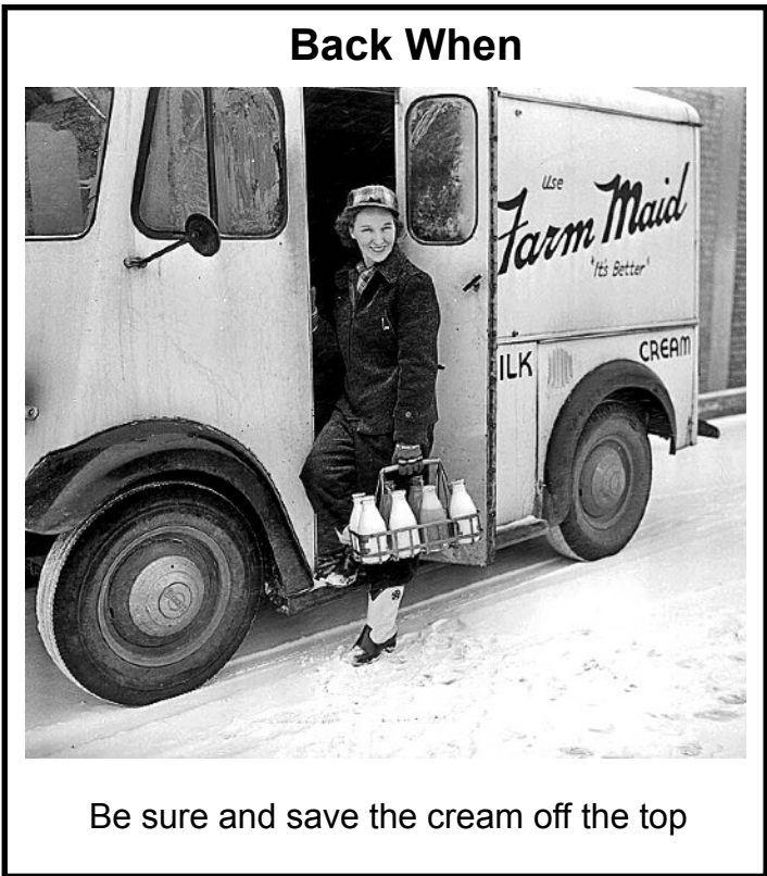
Be sure and save the cream off the top