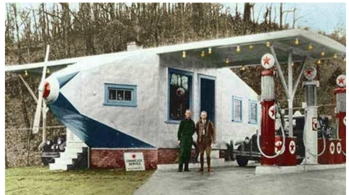
Powell, TN, North of Knoxville - Built in 1931, roughly shaped like the Spirit of St. Louis. Now restored and a barber shop.