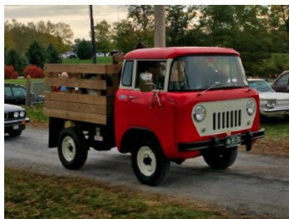
To the left a Willys FC150. To the right even a Ford F5 Stake bed can seem small in the truck class.