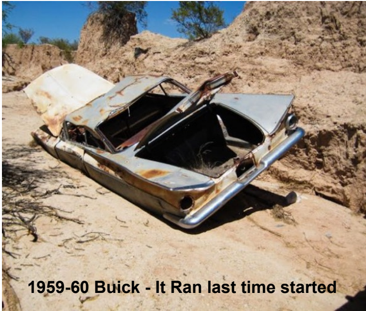
1959-60 Buick - It Ran last time started

Why do I have to press one for English when you're just going to transfer me to someone I can't understand anyway?