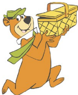
Davy Crockett Region AACA