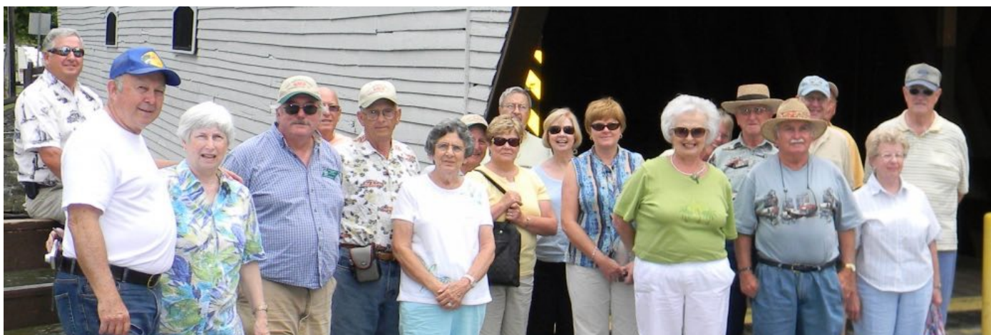
One last archive picture - 6/18/2011 Butler Trip - Looks like Elizabethton's covered bridge