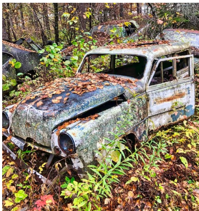
1951-52 Crosley Wagon All Original