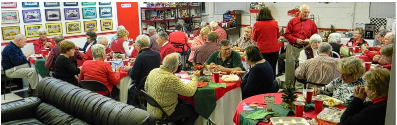
Lots of good food like all our gatherings, somethings never change