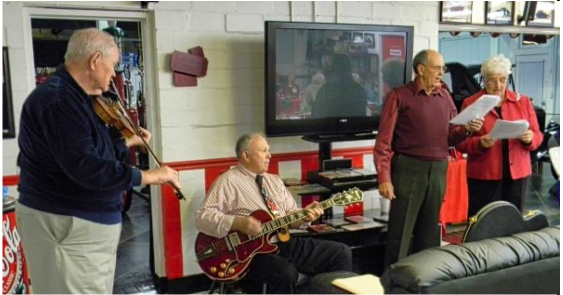
Even had a band at the Christmas Party