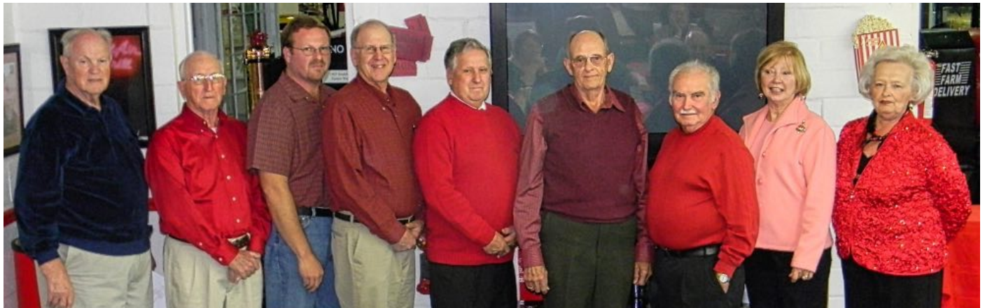
2011 Christmas Party - The 2012 Officers