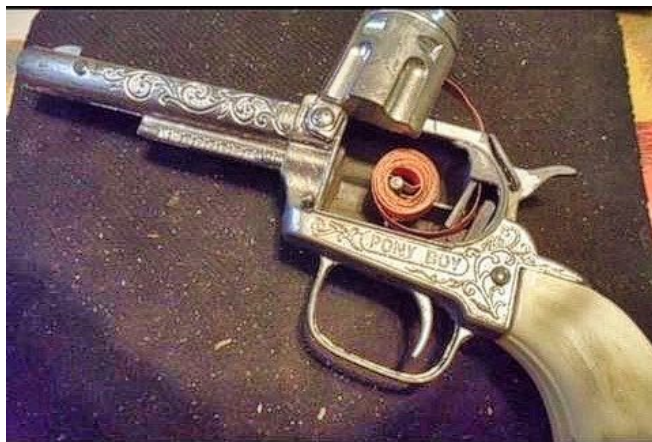
You can almost smell the caps