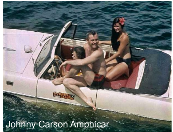
Johnny Carson Amphicar