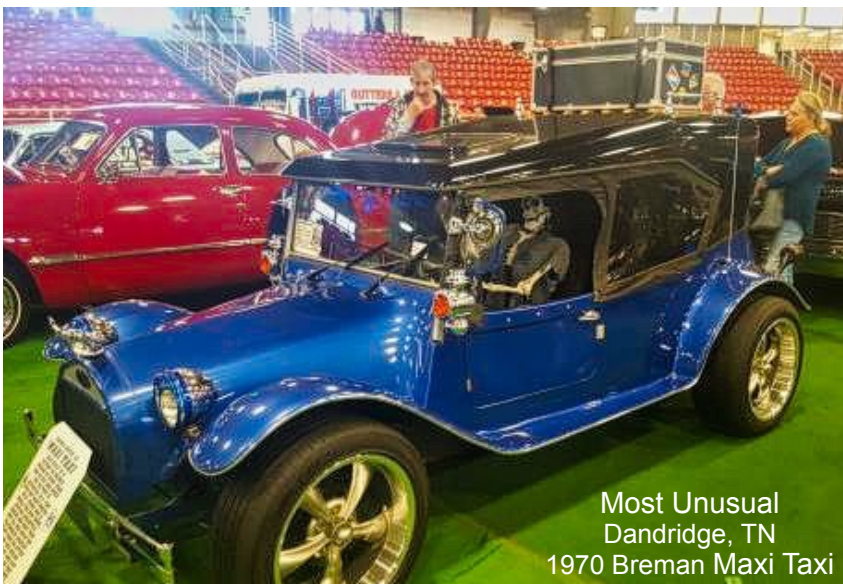
Most Unusual Dandridge, TN 1970 Breman Maxi Taxi

With over 60 entries from all over the country The City Garage's first Virtual Show was a big success. At least one of our members entered and an old friend of mine from NY tried for long distance but Washington is hard to compete with. For full results - Show results are on their web site.