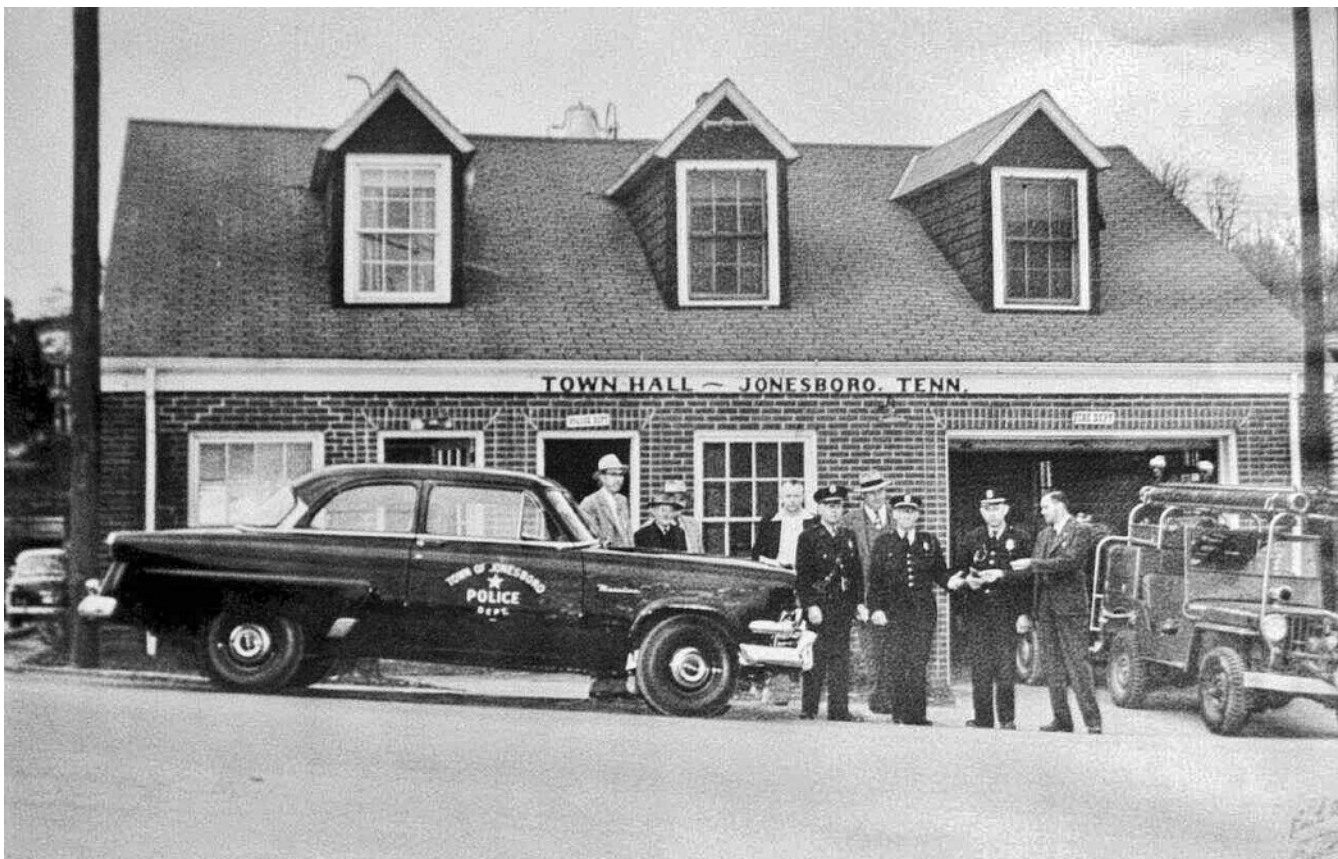
Jonesborough taking delivery of their brand new 1954 Ford police car. Note the Jeep brush truck on the right side. It was before they changed the spelling to the old style